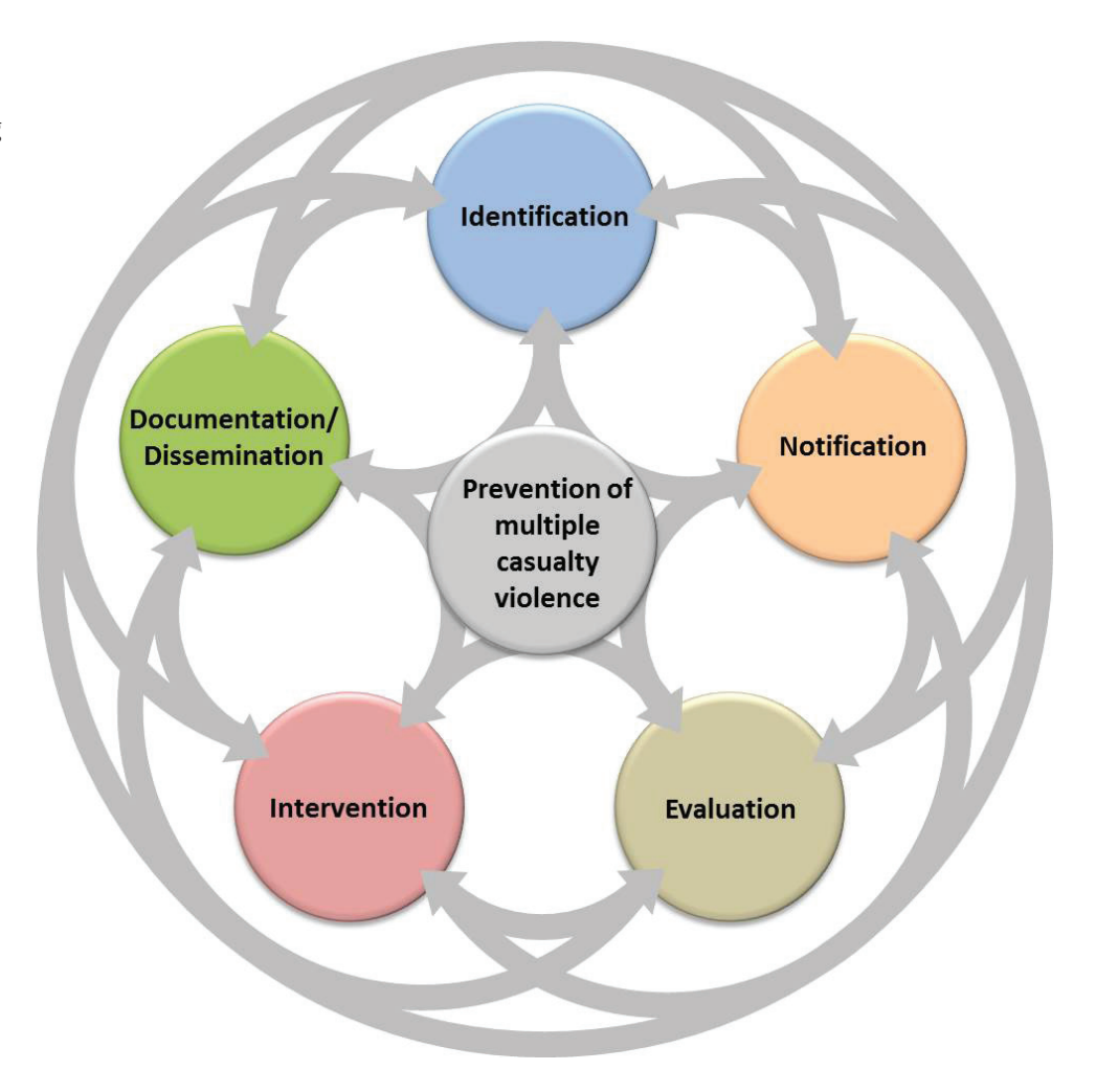
Figure 1. Components of Multiple Casualty Violence Prevention

In addition, the Young Adult Panel created a platform for dialogue particularly focused on improving the ability of governmental and non-governmental institutions and professions to identify potential perpetrators, provide the