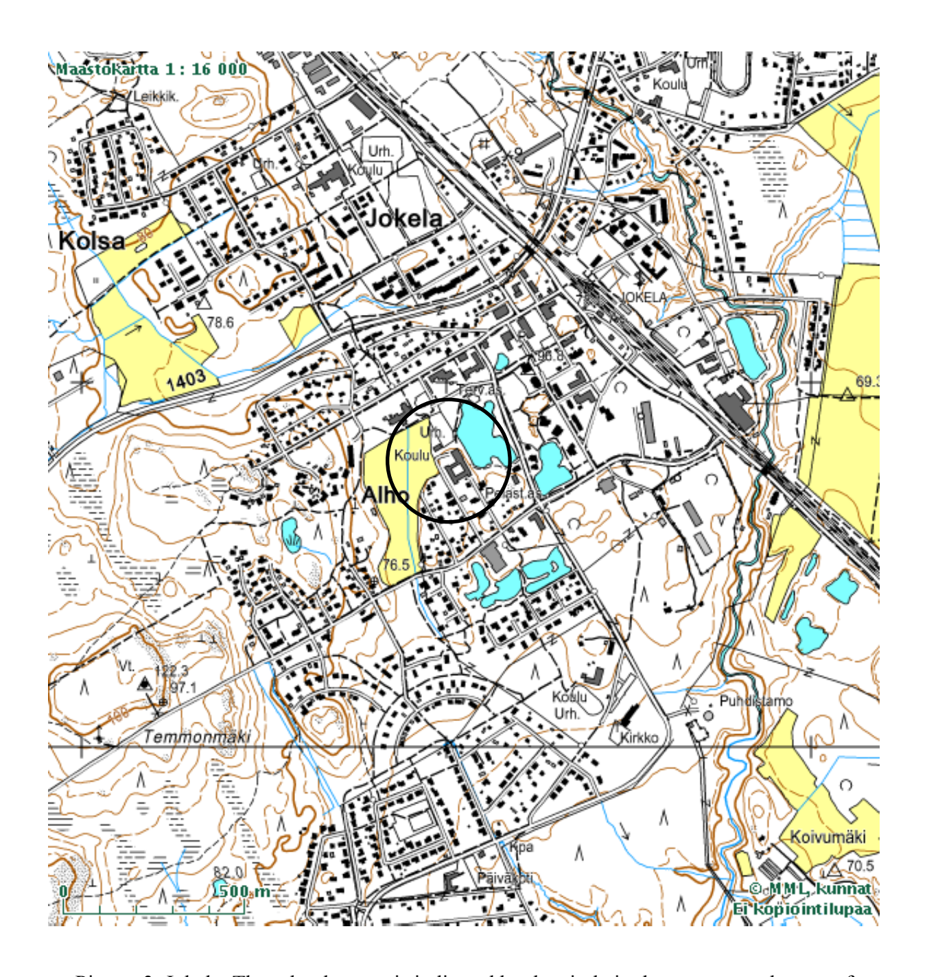
Picture 3. Jokela. The school centre is indicated by the circle in the centre, south-west of the pond (map from KTJ / Ministry of Justice / NLS).