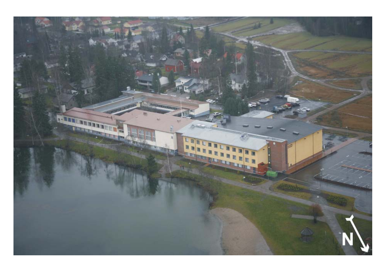
Picture 1. The Jokela School Centre viewed from the direction of the pond.