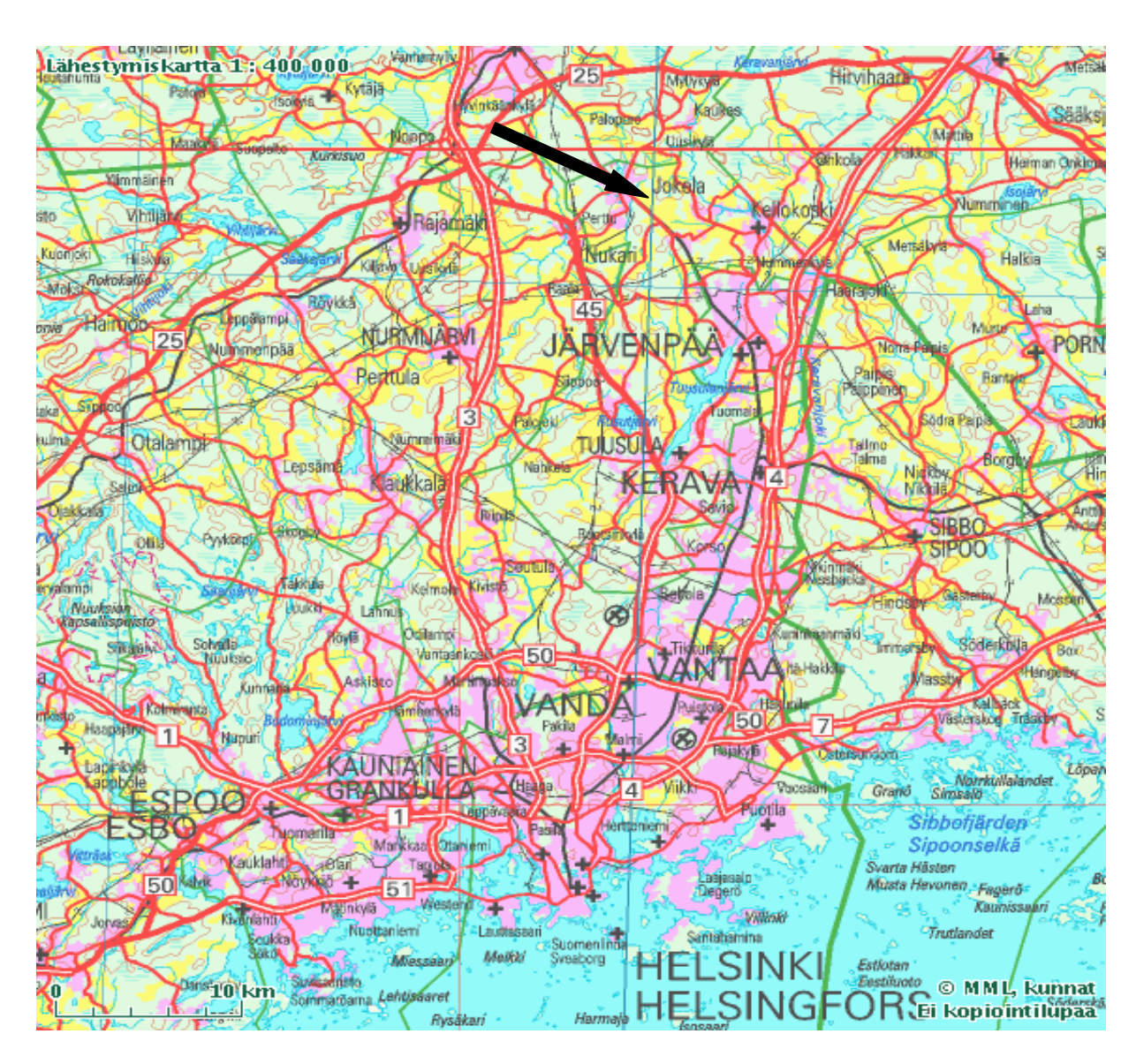
Picture 2. The location of Jokela (map from KTJ / Ministry of Justice / NLS).