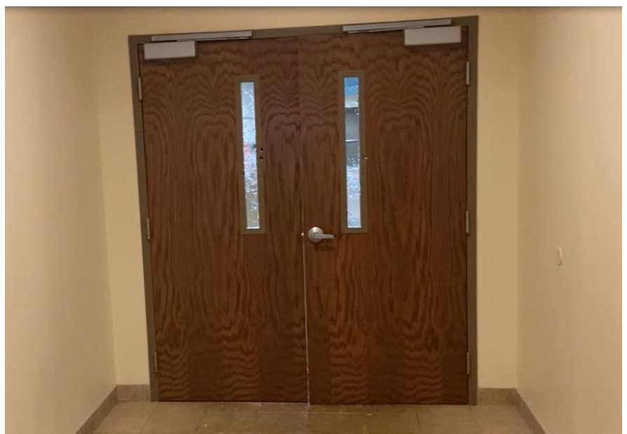
Photographs from the student lounge area on the first floor of The Covenant, taken by crime scene investigators following the homicides. The image on the left shows one of the television sets Hale shot. The image on the right shows the doors Hale fired through.