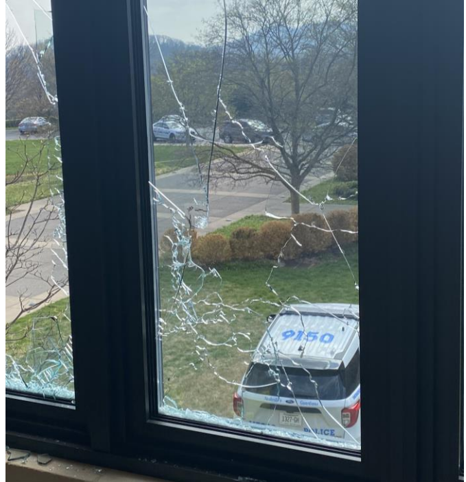
Photograph taken by crime scene investigators following the homicides, showing the vehicles Hale damaged in the distance.

As Hale fired upon the officers in the parking lot, other officers entered the school through a south entrance. These officers were initially unable to hear where the gunfire was coming from due to the layout of the school affecting acoustics. When they passed a stairwell leading to the second floor, they could hear the gunfire more clearly. Upon ascending to the second floor, they moved through the hallways towards the source of gunfire and eventually located Hale. Due to the audible fire alarm, the earplugs she was wearing throughout the attack, and the sound of her own gunfire, Hale never heard the police officers as they entered the lobby behind her. One officer then fired a 5.56mm caliber rifle at Hale, striking her and knocking her to the ground. As the officers approached Hale to take her into custody, they saw she still had possession of her firearms and her arms were moving. A second officer fired a 9mm caliber pistol at her. She was fatally wounded by the officers' gunfire.